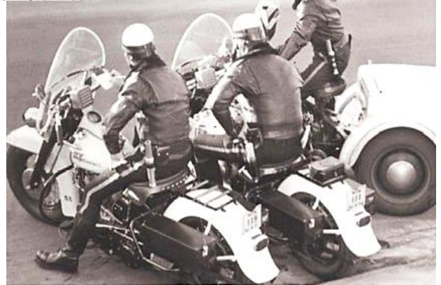
↑ 1955: Montgomery police watch while people boycotting buses gather at ride pickup station