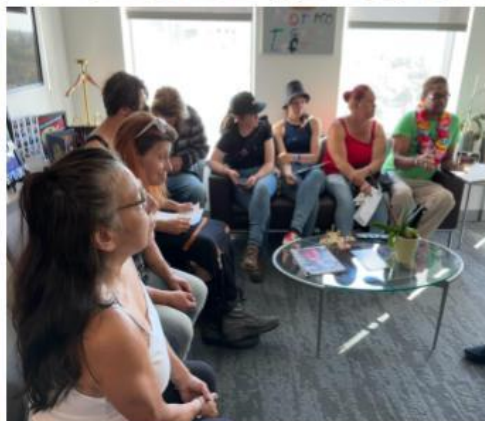
This was of course part of our Second Annual Homeless Helping Homeless Bike Ride to Sacramento. We had an even bigger turnout this year and made some lasting memories with our new and returning friends. We are grateful to Sunset Print Shop in Oakland for the T-shirt and bike flag printing!