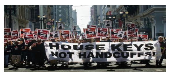
WESTERN REGIONAL ADVOCACY PROJECT

2940 16TH STREET, SUITE 200-2, SAN FRANCISCO, CA 94103