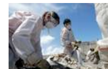
Samaritan's Purse Volunteers