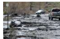
Flash Flood on the Poudre