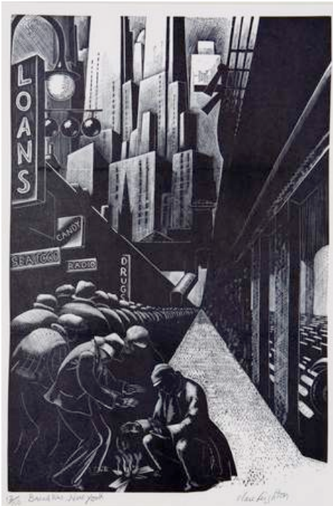
'Bread Line,' by Claire Leighton, can be seen as part of the 'Hobos to Street People' exhibit at the Loveland Museum/Gallery. / Courtesy of Loveland Museum/Gallery

While the current common image of homelessness is a woman pushing a shopping cart down the street or a man sleeping in a cardboard box, the plight of the homeless is much broader than that, said Art Hazelwood.