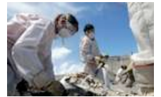
Samaritan's Purse Volunteers