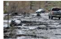
Flash Flood on the Poudre