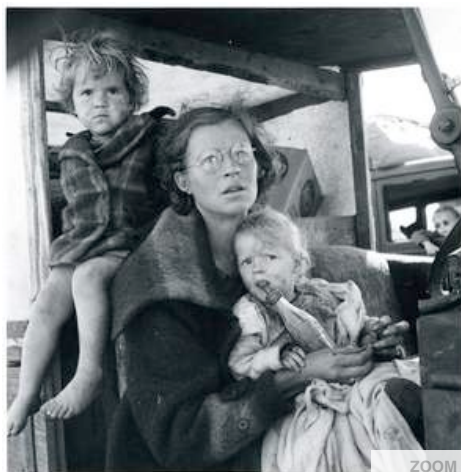
'Mother and Children on the Road,' by Dorothea Lange, can be seen as part of the Loveland Museum/Gallery exhibit 'Dorothea Lange: Precarious Lives,' which is running in conjunction with 'Hobos to Street People.' Both exhibits examine artists' responses to homelessness from the New Deal to the present.